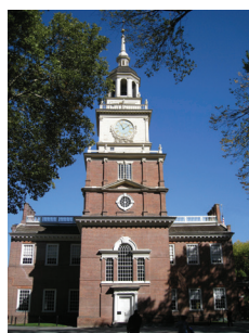
Independence Hall in Philadelphia.

When our founding fathers gathered to create a new country, many of their meetings took place in Philadelphia. Revolutionaries met before, during and after the Revolutionary War at different places in Philadelphia. Later, the city was the new nation's capital for 10 years while Washington, D.C., was being built.