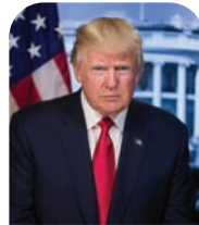
President Donald J. Trump

President Donald J. Trump is expected to be the Republican nominee for president. He was elected in 2016. According to the U.S. Constitution, he is allowed to serve one more four-year term.