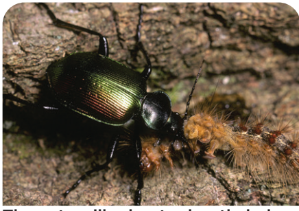
The caterpillar hunter beetle helps control the gypsy moth caterpillar, which destroys U.S. forests.

Beetles' hardened wing covers protect them like a suit of armor. These help keep beetles safe from predators, or animals that want to eat them.