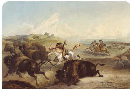
This painting, "Indians Hunting the Bison," was created by Karl Bodmer in 1839.

Baby bison are sometimes called "red dogs" because their fur is reddish in color when they're born. When they're a few months old, their fur starts to turn dark brown and the characteristic hump begins to grow.