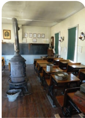
Younger children sat close to the stove, with the oldest kids sitting the farthest away. This school was built in the 1870s in Nebraska.

On the frontier, children from ages 6 to 14 would all go to class together in the same room. As they got older, they probably heard every grade's lessons year after year. By graduation, they'd know the subjects backward and forward.