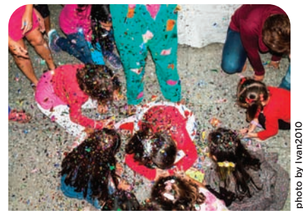
Mexican kids scramble for candy after a piñata is broken open.

The second part of each night's celebration is fun. Families move onto the patio for the breaking of piñatas . When somebody finally breaks open the piñata, everyone scrambles for the goodies inside.