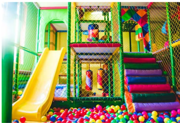
Photo 1: This photo shows a playground. Is the playground a safe place to play? Yes! Playgrounds are great places to go play with your siblings, parents, or guardians. Be careful climbing the steps. Keep all your arms and legs inside while riding down the slide and make sure you are well out of the way if someone is swinging if you run by the swings.

I would like you to identify what the photo is and then give your reasons as to whether that place is safe or unsafe to play.