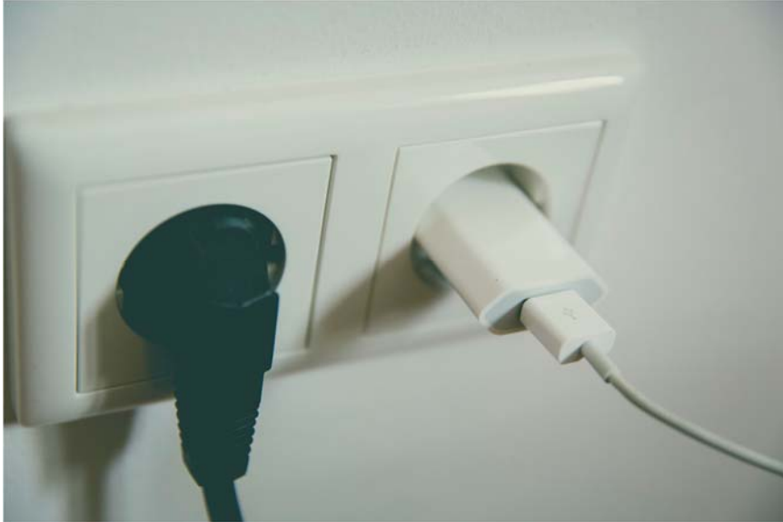
Photo 4: This photo shows electrical outlets, which is where we plug in our phones, gaming consoles, and other devices. Are electrical outlets safe to play with? No! They can hurt you. Leave them alone. Never plug in an electrical device without an adult's permission and never touch anything that is plugged into an electrical outlet if your hands are wet.