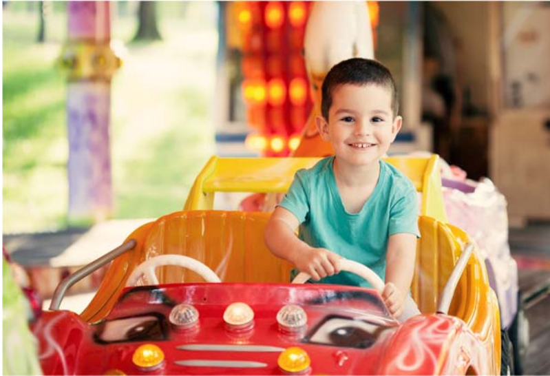
Photo 9: This is a photo of someone at an amusement park. Is an amusement park a safe place to play? Yes! Amusement parks and carnivals are fun places to go with your parents or guardians. It is easy to get lost in such a crowded place. Make sure you stay right with your parents or guardians and hold their hands. If you should get lost for any reason, look for a security officer with a badge or an amusement park worker with a name tag. They should be able to take you to a safe place for your parents or guardians to find you.

Are there other safe places to play that you can think of?