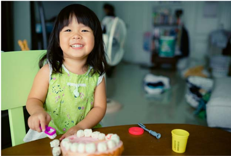
Photo 5: This is a photo of a classroom. Is your classroom a safe place to play? Yes! When your teacher gives the word, follow their directions and play nice with everyone. Be sure to share your toys and tools. Allow everyone a chance to play.