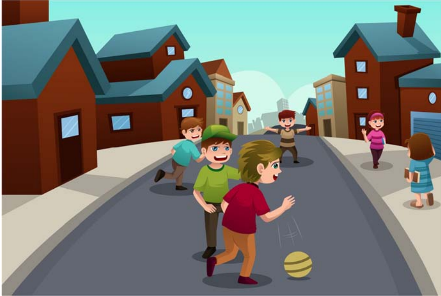
Photo 2: This photo shows a street. Is the street a safe place to play? No! Cars use the street to drive. They may not see you, may not stop in time, or sometimes they might be driving too fast to stop appropriately. Ask your parents or guardians if they can take you to a nearby park or play in a backyard.