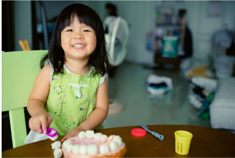
Photo 5: This is a photo of a classroom. Is your classroom a safe place to play? Yes! When your teacher gives the word, follow their directions and play nice with everyone. Be sure to share your toys and tools. Allow everyone a chance to play.