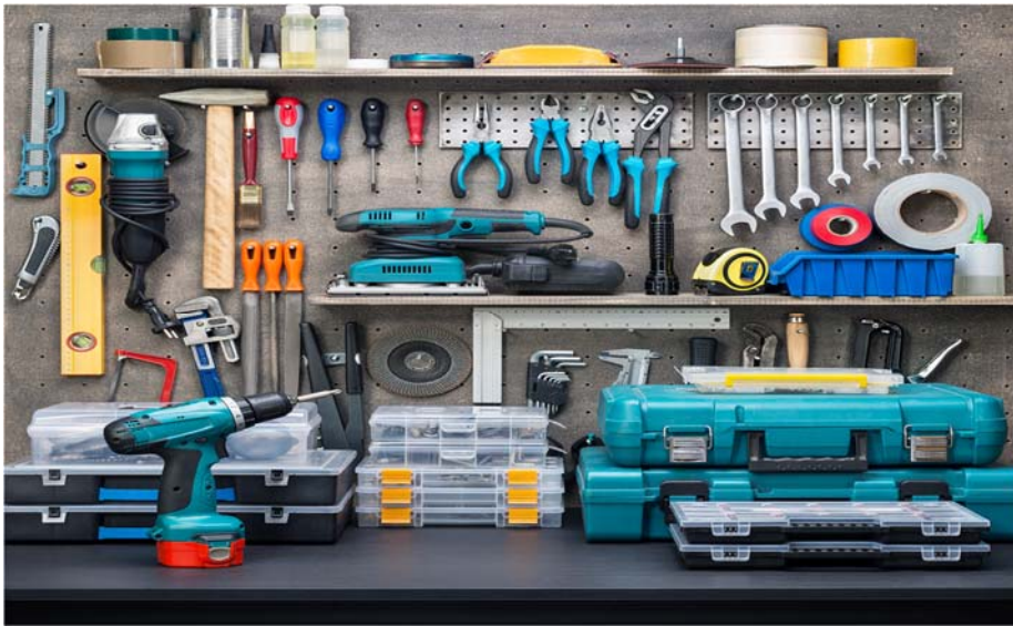
Photo 6: This is a photo of a garage or basement with tools. Is a garage or basement filled with shop tools a safe place to play? No way!

These tools should only be used by an adult or with adult supervision. Power tools can be especially dangerous even when handled by an adult. Never play with any shop tools.