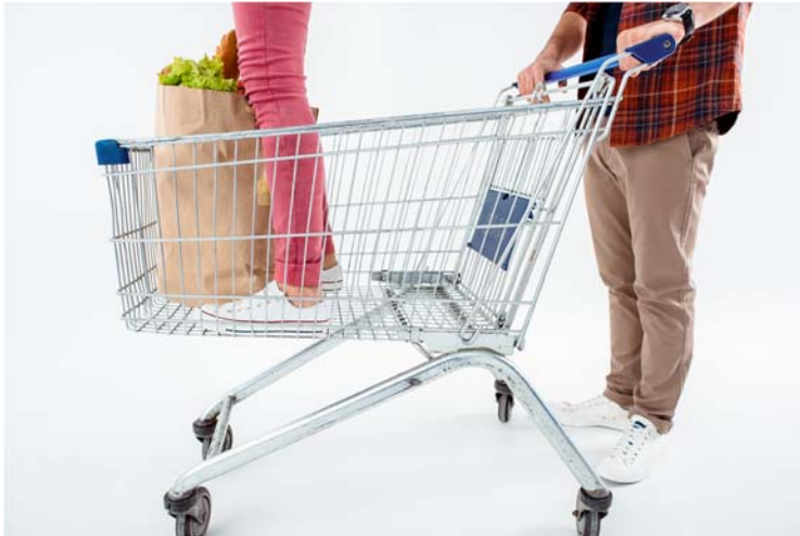
Photo 8: This is a photo of someone standing in a grocery cart. Is a grocery cart a safe place to play? No! It is a convenient way for your parents or guardians to do their shopping. Do not stand up in the cart. If it topples over, you could get hurt.