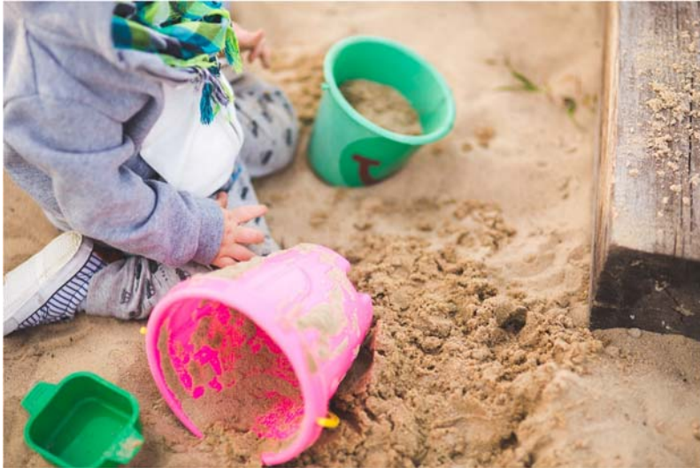
Photo 3: This photo shows a sandbox. Are sandboxes safe places to play? Yes! Make sure you do not rub your eyes when you are playing with sand. Do not pour sand over your head because sand may get in your eyes and burn. Ensure you do not get sunburned by having your parent apply sunscreen to you before you go out.