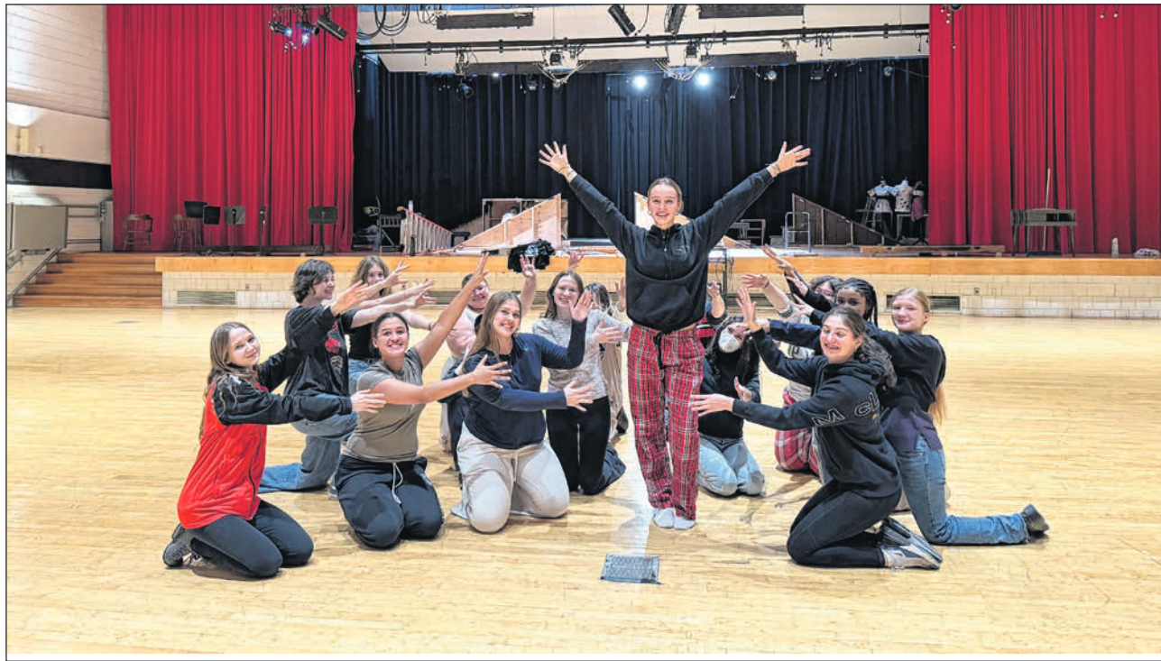
Students rehearse for "Chicago: Teen Edition".

For "Chicago: Teen Edition", Salem High Building & Property Maintenance students helped measure and cut lumber used to