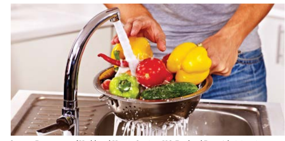
Sources: Department of Health and Human Services; U.S. Food and Drug Administration; National Science Teachers Association; Centers for Disease Control and Prevention; and the Partnership for Food Safety Education