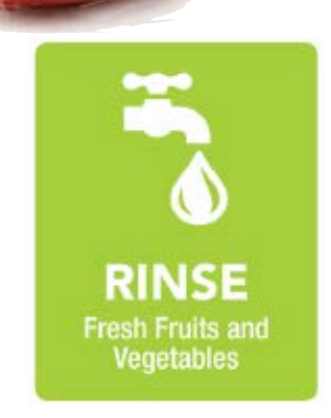
Fight BAC! like a producepro. fightbac.org/food-safety-education/ safe-produce

Do not wash meat, poultry or eggs. Washing raw meat and poultry can actually help bacteria spread, because their juices may contaminate your sink and countertops. All commercial eggs are washed before sale. Any extra handling of the eggs, such as washing, may actually increase the risk of crosscontamination, especially if the shell becomes cracked.