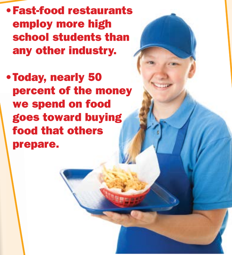
Sources: Department of Health and Human Services; U.S. Food and Drug Administration; National Science Teachers Association; Centers for Disease Control and Prevention; and the Partnership for Food Safety Education

Knowing who you are is the first step in being healthy and taking charge of your life. Keeping a journal is a great way to learn more about yourself. Who are you? Why do you do what you do? Do you have strong convictions? Are you able to stand up to others when your ideas are questioned? In other words, what makes you, you? While you read through this food safety publication, keep a journal, cataloguing your thoughts and ideas about what you are reading and learning. In addition, read your local newspaper to learn more about the world around you. Each day, write down your thoughts about something you read in the newspaper. To begin your journal, write about something that you have read in the newspaper and in this publication that directly affects your life. Share some of your journal entries and thoughts with your peers and teachers.