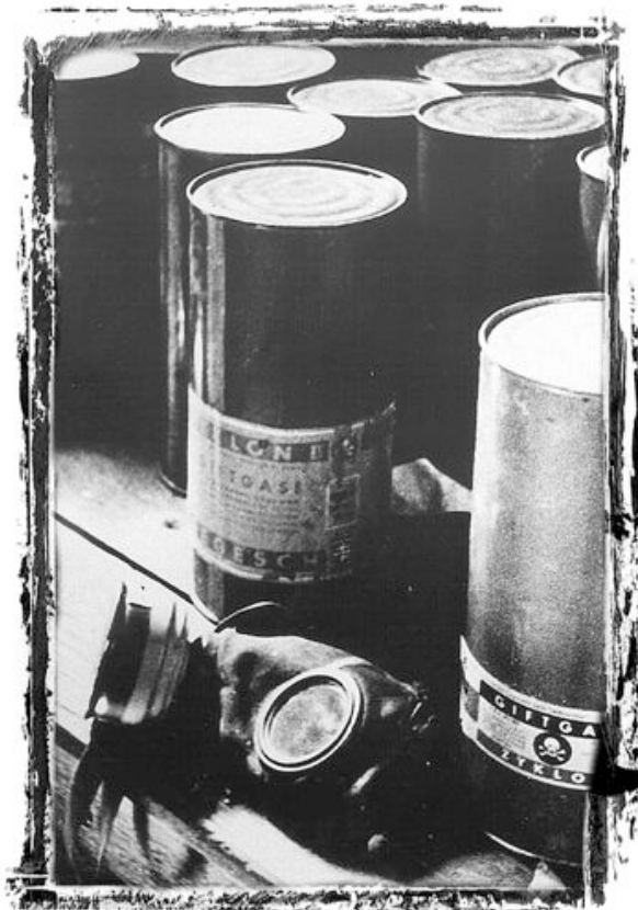
Containers of Zyklon B, the poisonous gas used to kill prisoners at the Majdanek killing center in Poland, were confiscated during liberation of the camp.

The Final Solution, Continued on page 12