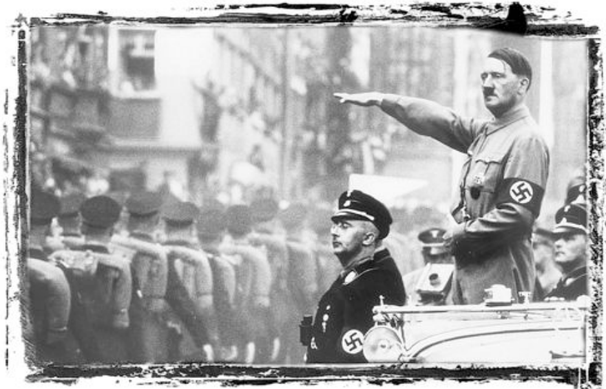
Nazi leader Adolf Hitler and Heinrich Himmler, head of the German Police, reviewed SS troops during Reich Party Day ceremonies in Nuremberg, Germany, September 1938.

For years, Hitler had been obsessed with ideas about race. He believed the German race, which he called Aryan, 3 was racially superior to others, such as Poles and Gypsies. He even sin-