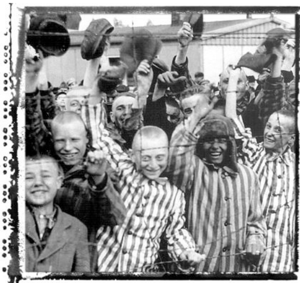
Survivors of the Dachau camp cheer approaching U.S. troops during liberation in April 1945.

5 Discuss the importance of being unselfish and helping others in distress. Look in today’s newspaper and find either a picture of or an article about a person who put someone else’s needs above his own. What were the consequences of the unselfish act? What might have happened if the person had not acted?