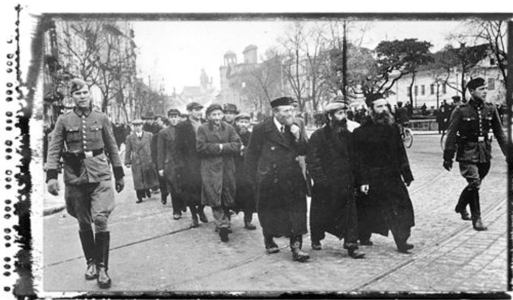
Jews captured by German police were led down a Warsaw street in the fall of 1939. They were eventually taken to a site where they were forced to clear rubble.

Despite the horrible conditions, many Jews managed to survive. Little did most know, however, that their efforts would be in vain. What awaited them next would prove more gruesome than anyone could comprehend.