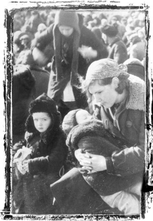
Mass executions of Jews were common in the Soviet Union. The Jews assembled in this photo are believed to have been executed in October 1941 in Lubny. Nearly 1,400 Jews, Communists, and partisans died at the hands of the same platoon of German soldiers who murdered the young mother and others shown here.

Shortly after Germany invaded Poland, many Polish citizens were resettled or sent to concentration camps. This created the much talked about "living space," and Germans flocked into the emptied Polish country side.