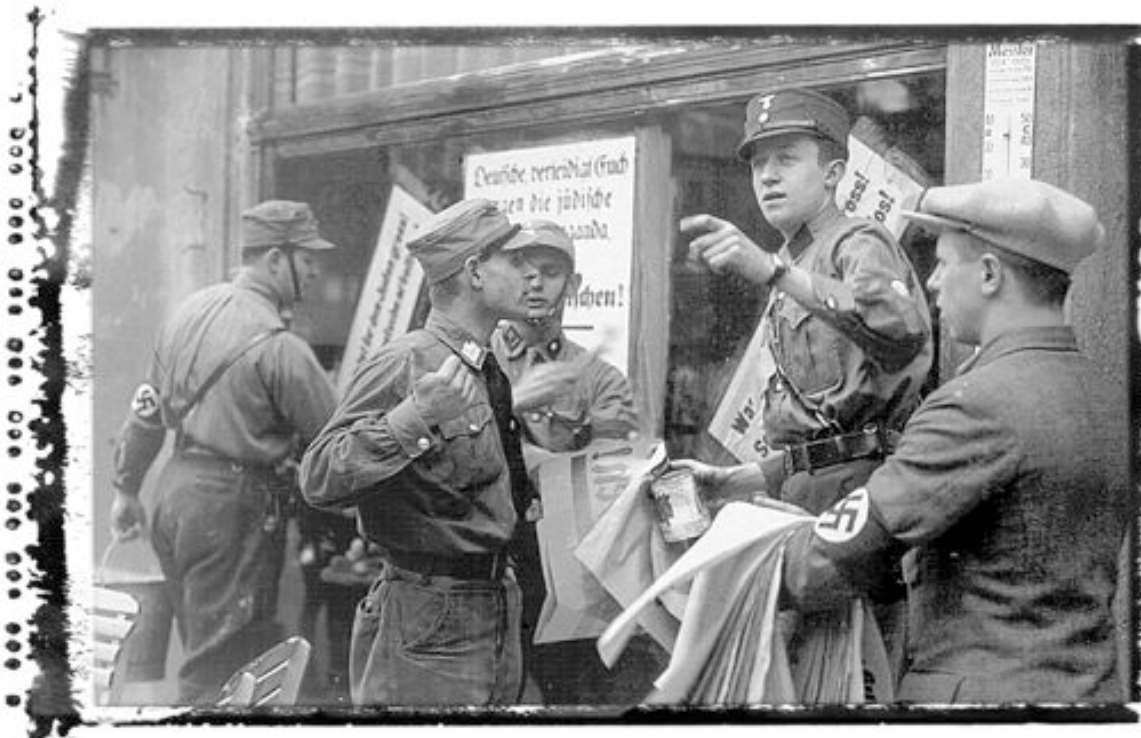
Jewish-owned businesses were among the first targets of the Nazi campaign of hatred. Here, Nazi SA members and a German civilian posted boycott signs, most of which read, "Germans defend yourselves against Jewish atrocity propaganda; buy only at German stores."

Although many people feared Hitler would become a dictator, there was no one else with enough power to lead Germany through the hard times. In 1933, aging President Paul von Hindenburg reluctantly appointed Hitler chancellor, the nation's most powerful position. Finally, Hitler was set to take control of Germany, and the nightmare would begin. ■