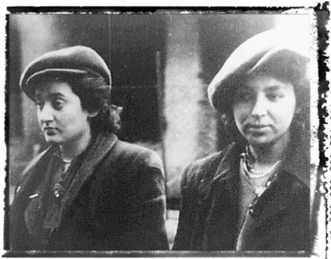
Among those captured during the suppression of the Warsaw ghetto uprising were these female members of the Jewish resistance.

As the Jews realized that the Nazis’ ultimate plan for them was death, they turned to more violent forms of resistance. They formed guerrilla groups and organized ghetto and camp upris-