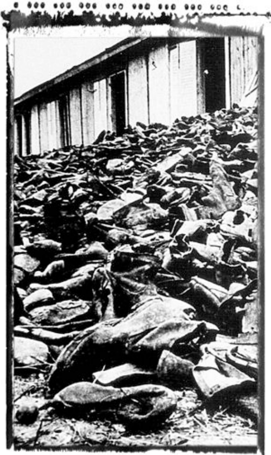
Among the items left behind at the Majdanek camp in Poland was this mound of victims' shoes.

Stacks of dead bodies lay rotting in the sun. Those who were still alive had gone without food for so long that they looked like living skeletons. Many died even after Allied troops and relief workers arrived with food and medical supplies. At Bergen-Belsen, where 60,000 prisoners were found alive, 14,000 died shortly after liberation and another 14,000 wouldn't make it past the next few weeks.