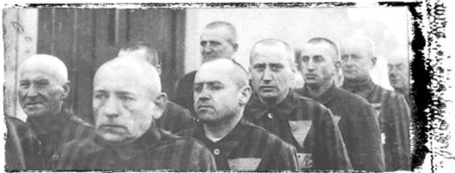
Prisoners of Sachsenhausen concentration camp in Germany stood in columns under the supervision of a camp guard.