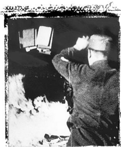
During a public burning of "un-German" books in Berlin, a member of the SA threw confiscated books into the fire.

Before long, the Nazi propaganda fostered a blind obedience among German citizens. This obedience would become increasingly important as Hitler would push the Holocaust into its next tragic phase. ■