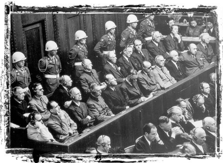
Many of the defendants, shown seated in "the dock" at the Nuremberg trial of war criminals, were charged primarily with launching an illegal war.

A study released in the United States in 1997