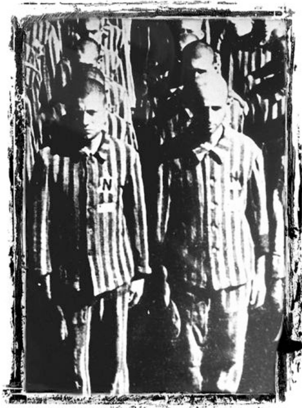
Dutch Jews, wearing prison uniforms marked with a yellow star and the letter N for Netherlands, stood at attention during roll call at the Buchenwald concentration camp.

Sometimes physical attacks against a group of people turn deadly. This final step in the ladder of prejudice has been present in society since the earliest days.