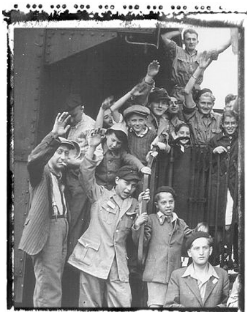
Jewish children at the Buchenwald Displaced Persons camp waved goodbye to friends as they prepared to depart for France. From France, some traveled on to Palestine, part of which later became the State of Israel.

"We have written a glorious page in our history," said Heinrich Himmler, the man in charge of the concentration and death camps. "We have taken everything they (the Jews) owned." ■