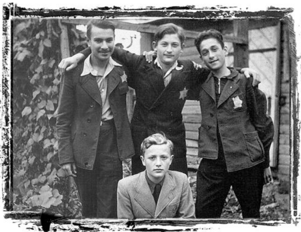
Members of a youth movement in the Kovno ghetto of Lithuania posed for a group portrait. The movement, called the Irgun Brit Zion, or IBZ, was founded during the Soviet occupation in 1940-41. Its members originally fought to preserve Jewish, Hebrew, and Zionist culture, but they soon found themselves fighting for physical preservation as well. Most were 15 or 16 years old.

“Let the epic of heroic deeds of love, as opposed by those of hatred, of rescue as