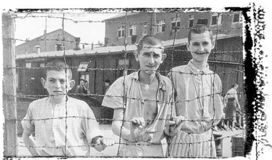
Young survivors of Buchenwald concentration camp awaited help behind a barbed wire fence.

There were several different types of camps set up by the Nazis during the Holocaust. There were concentration camps, which were originally designed to “concentrate” political prisoners in one area. There were also forced labor camps, transit camps, prisoner-of-war camps, and finally, death camps. Not all the camps were set up solely for killing, but many people died because of the horrible conditions that existed.