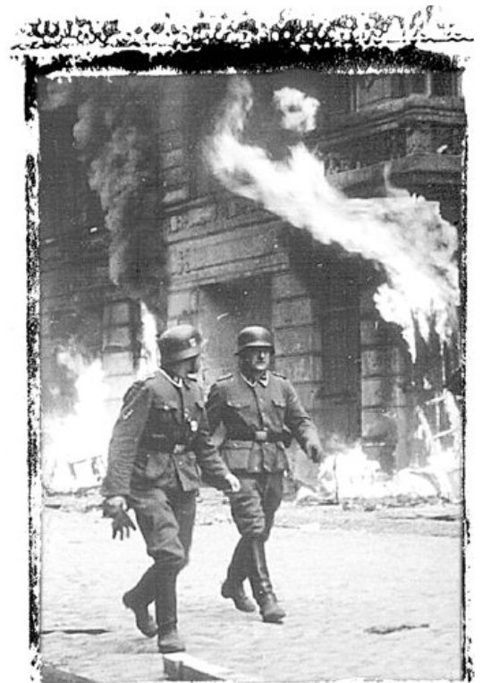
SS troop members walked past a block of burning buildings during the suppression of the Warsaw ghetto uprising in 1943. The uprising, a 20-day battle led by Jewish fighting forces, began when German troops entered the ghetto to begin the final round of deportations. Despite the Jews best efforts, the Nazis prevailed. Some 56,000 Jews were reportedly killed or captured.

By the time these squads were ordered to stop killing in 1942, 1.5 million Jews were already dead. ■