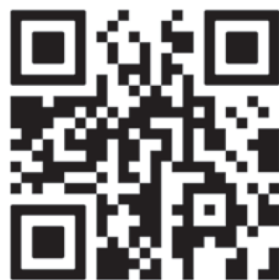
Mulch Pickup Sites

For more information, visit Pinellas.gov/mulch or scan this QR code for an online map of the mulch pickup sites.