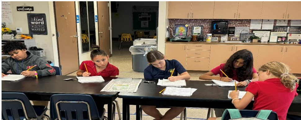
Morning Math: Using the Tampa Bay Times weather section to calculate statistics such as range, mean, median and mode.